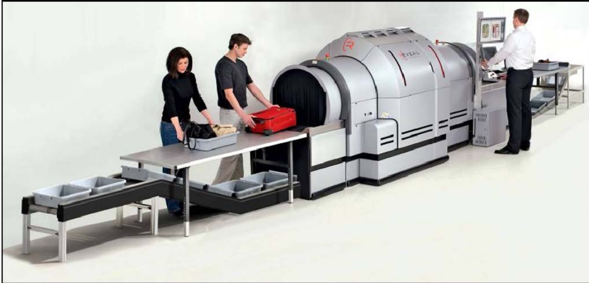
Reveal "FUSION" EDS – Over 300 bags per hour with automated liquid and HME detection

the total number of items requiring inspection by up to 50% as compared to today's checkpoint regulations.